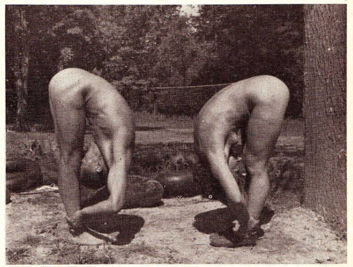
Sun Valley Garden is a family camp, with fun for the kiddies and rest and relaxation for the parents. There is also a small group of the members who are very interested in physical exercises and physical culture. The above photos demonstrate that at least two of the members are very proficient at this. The sports programme at Sun Valley Gardens is varied, interesting and healthful.

Eastern Division Treasurer of the Canadian Sunbathing Association, and member of Sun Valley Garden Club demonstrates a couple of his favorite "stunts".